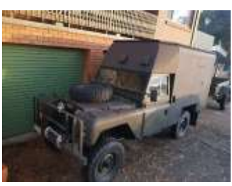
An Army Land Rover Series 2A 4x4 ambulance.